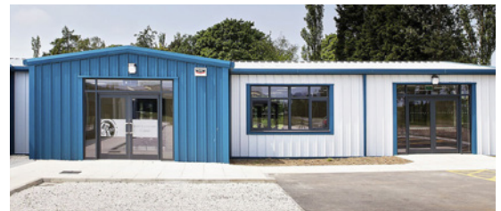
Lady Eastwood Centre Meeting Rooms, Newark Showground, NG24 2NY

(what3words locator: https://w3w.co/firm.graph.shocks )