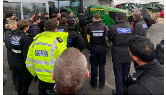
Live Demonstration on CESAR Stand: B-21A